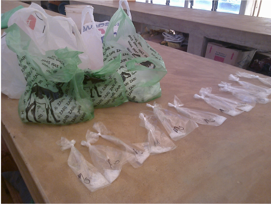
Fig 1. Fertiliser packed in small plastic bags in readiness for being added to soil in pots