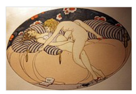
A 1925 <u>Gerda Wegener</u> painting, "Les delassements d'Eros" ("The recreations of Eros"), of two women engaged in sexual activity in bed

sexual behavior is sometimes viewed as solely for physical pleasure. <u>Men who have sex with men</u>, as well as <u>women who have sex with women</u>, or men on the "down-low" may engage in sex acts with members of the same sex while continuing sexual and romantic relationships with the opposite sex.