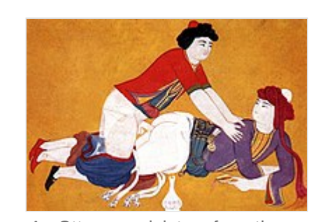
An Ottoman miniature from the book Sawaqub al-Manaquib depicting homosexuality

It is possible for a person whose sexual identity is mainly heterosexual to engage in sexual acts with people of the same sex. Gay and lesbian people who pretend to be heterosexual are often referred to as being