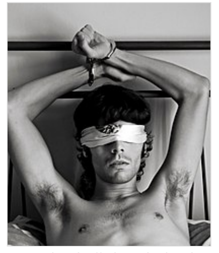
A man handcuffed to a bed and blindfolded

B/D (bondage and discipline) is a part of BDSM. Bondage includes the restraint of the body or mind. D/s means "Dominant and submissive". A Dominant is one who takes control of a person who wishes to surrender control and a submissive is one who surrenders control to a person who wishes to take control. [63] S/M (sadism and