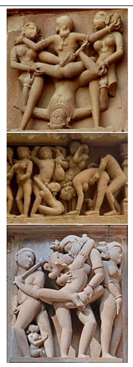
Khajuraho Hindu and Jain temple complex is famous for erotic arts.

Swinging involves singles or partners in a <u>committed relationship</u> engaging in sexual activities with others as a <u>recreational</u> or social activity. [57] The increasing popularity of swinging is regarded by some as arising from the upsurge in sexual activity during the sexual revolution of the 1960s.