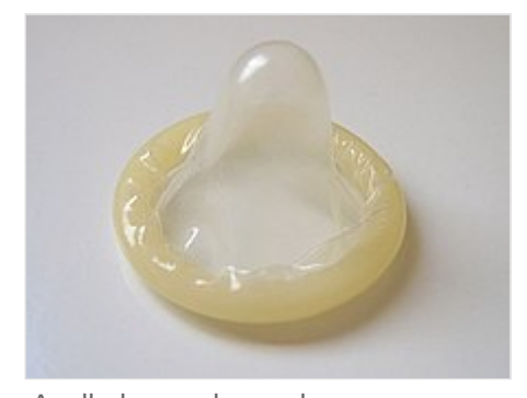
A rolled-up male condom

Sexual activity that involves skin-to-skin contact, exposure to an infected person's <u>bodily fluids</u> or <u>mucous membranes<sup>[33]</sup></u> carries the risk of contracting a sexually transmitted infection. People may not be able to detect that their <u>sexual partner</u> has one or more STIs, for example if they are asymptomatic (show no symptoms). The risk of STIs can be reduced by <u>safe sex</u> practices, such as using condoms. Both partners may opt to be tested for STIs before engaging in sex. The exchange of body fluids is not necessary to contract an infestation of crab lice. Crab lice typically are found attached to hair in the pubic area but sometimes are found on coarse hair elsewhere on the body (for example, eyebrows, eyelashes,