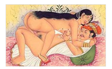
This Indian Kama sutra illustration, which shows a woman on top of a man, depicts the male erection, which is one of the physiological responses to sexual arousal for men.